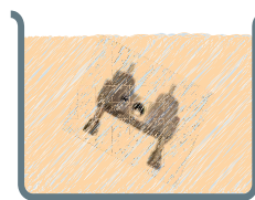
Hot air drying